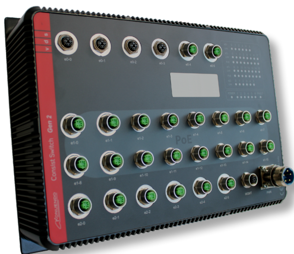
*Preliminary image, for reference only

The 28 ports Gigabit Ethernet Consist Switch (Gen2) is a Gigabit/ Fast Ethernet Layer 2 managed switch EN 50155 compliant , specifically designed for network applications in Rolling-Stock environments.