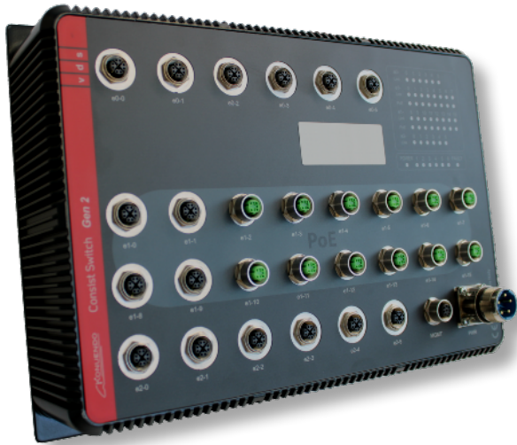
*Preliminary image, for reference only

The 28 ports Gigabit Ethernet Consist Switch (Gen2) is a Gigabit/Fast Ethernet Layer 2 managed switch EN 50155 compliant , specifically designed for network applications in Rolling-Stock environments.